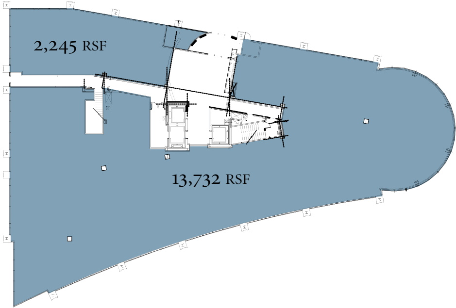
GROUND FLOOR PLAN – RETAIL

A TYSONS CORNER LANDMARK, TOWERS CRESCENT IS THE NEW CITY CENTER AND HEART OF NORTHERN VIRGINIA'S MOST DYNAMIC COMMERCIAL HUB.